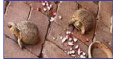
The turtles at the historic home!